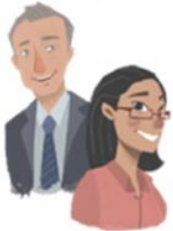
Exporters and Trade Professionals

1. Pre-program: exporters upload their briefs to Practera