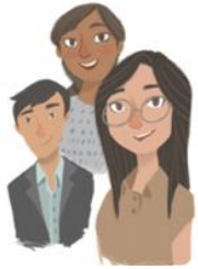
YOU & Your GTA Team