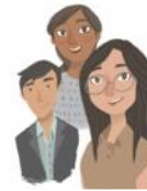
YOU & Your GTA Team