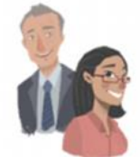
Exporters and Trade Professionals